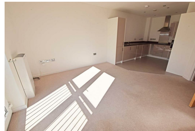
12, Rogallo Place, Pilots View, ME4 6FE 75% Shared Ownership £167,000